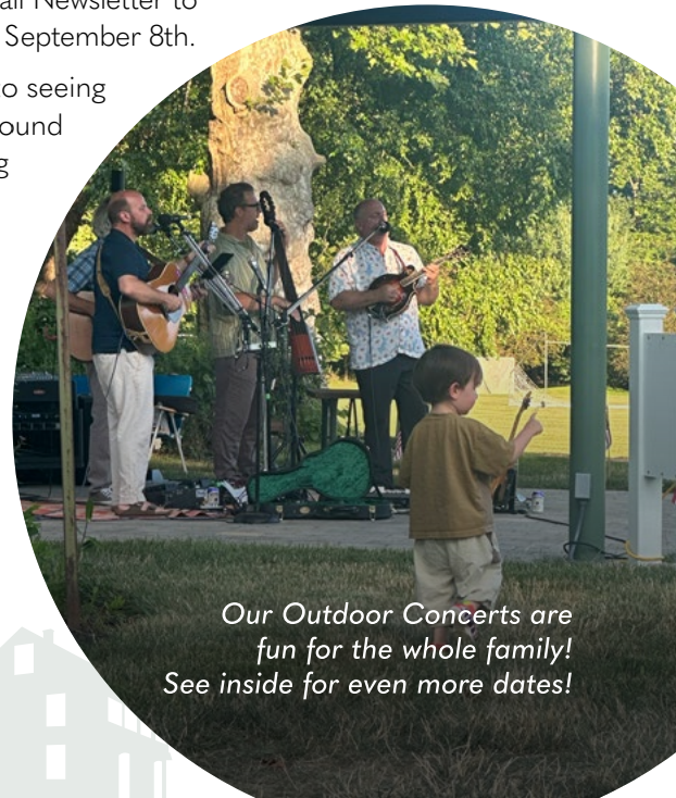
Our Outdoor Concerts are fun for the whole family! See inside for even more dates!