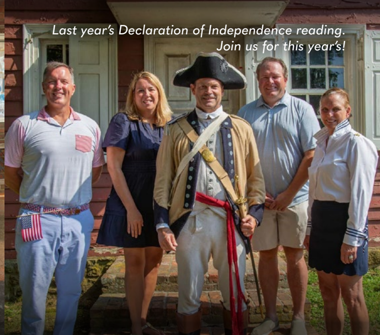
Last year's Declaration of Independence reading. Join us for this year's!

Wishing everyone a sun and fun-filled spring! Now that 2025 is well underway, we have so much to look forward to this year.