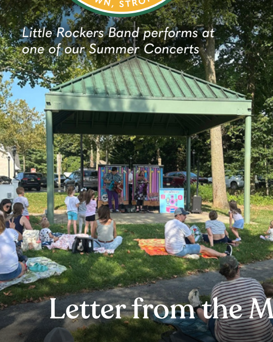
Little Rockers Band performs at one of our Summer Concerts