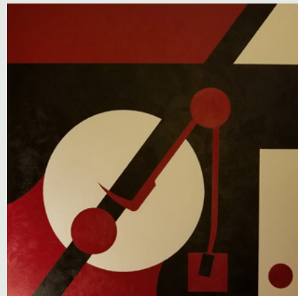
"Music is in the Eye of the Beholder" Acrylic on Canvas, 24" x 24"