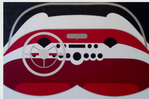
"1953 Corvette" Acrylic on Canvas, 24" x 36"