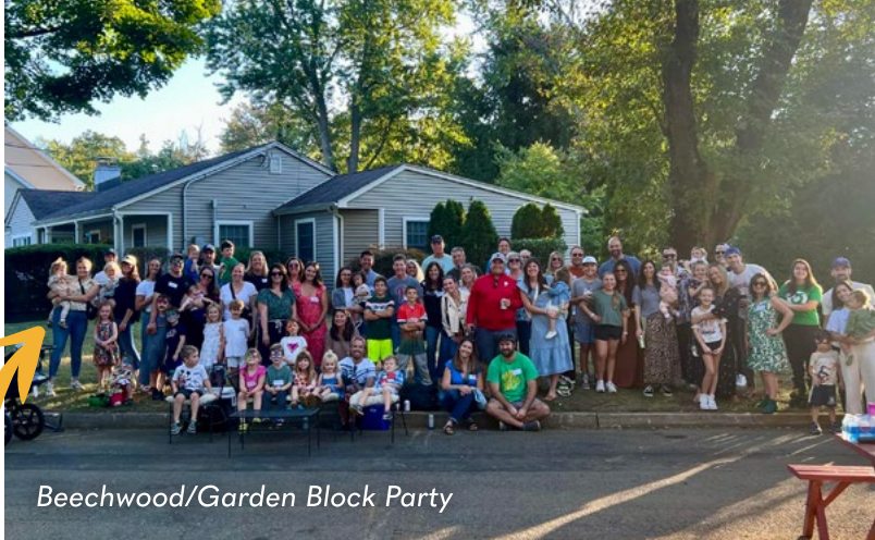
Beechwood/Garden Block Party