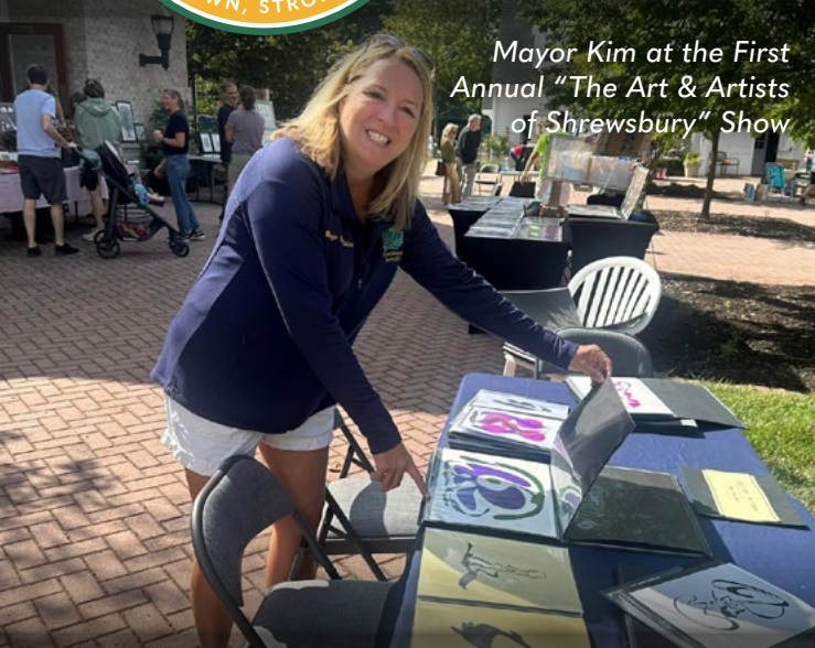
Mayor Kim at the First Annual "The Art & Artists of Shrewsbury" Show