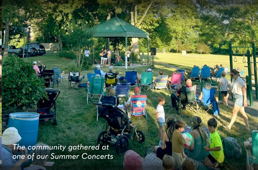
The community gathered at one of our Summer Concerts