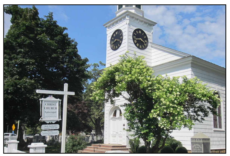
Christ Church at the Intersection of Sycamore Ave. & Broad St.

Shrewsbury Borough (as it exists today) was formed in 1926, encompassing 2.3 square miles. Shrewsbury is one of the earliest settlements in Monmouth County. Historically an old crossroads village, Shrewsbury has a National Historic District at the intersection of Sycamore Avenue and Broad Street, known as "Historic Four Corners." Shrewsbury is home to several late 18th to early 20th century homes and churches, including the Christ Church and the Allen House, which were both listed on the National Register of Historic Places in 1978. Commercial development in the borough is located along Route 35, and 1950's suburban development lies in the northern and eastern sections of the borough.